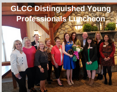
GLCC Distinguished Young Professionals Luncheon