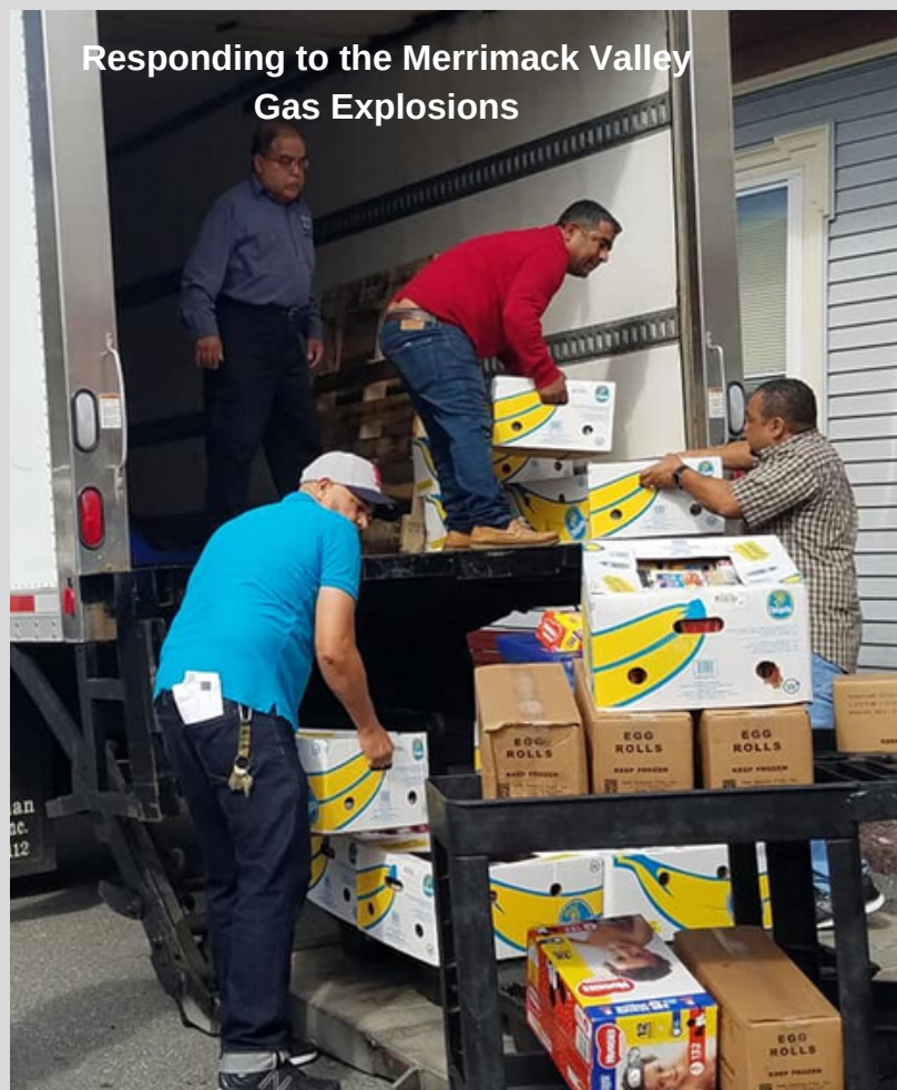
Responding to the Merrimack Valley Gas Explosions