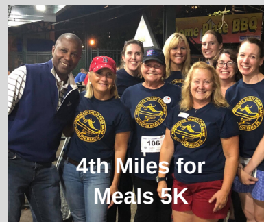
4th Miles for Meals 5K