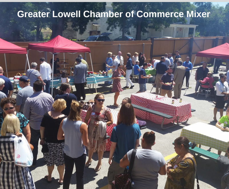
Greater Lowell Chamber of Commerce Mixer